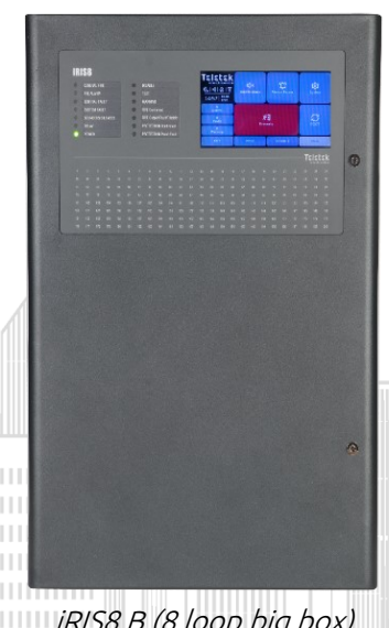
iRIS8 B (8 loop big box)

iRIS8 S is the basic version of the panel which allows 4 loop controller configuration in a single box (the same quantity as regular iRIS). This version has build-in feature for expansion by adding another external 4 loop extension box.