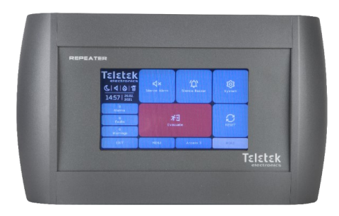
approved to EN54 Parts 2 & 4

The Repeater is a device that duplicates the information provided by the SIMPO and IRIS addressable fire panels. It helps you get information on the current situation in the premises without having to be physically close to the main panel. The connection between the Repeater panel and the main panels is obtained by using a RS 485 redundant network module based on the RS485 interface. The monitoring information is displayed on the 7 inch touch screen LCD display. There is also LED indication available. The Repeater panel has a built-in real time clock. Available micro USB for latest software and firmware updates.